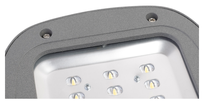
Uniform light distribution by using asymmetric optics

The luminaire has an integrated surge protection and it is suitable for poles with a diameter of max. 48mm. An adapter for poles with diameter 60mm is available under order number 51754.