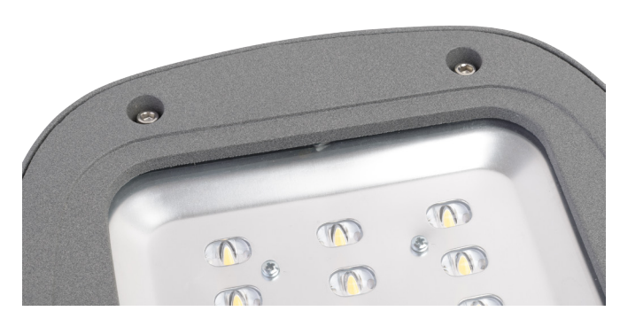
Uniform light distribution by using asymmetric optics

The luminaire has an integrated surge protection and it is suitable for poles with a diameter of max. 48mm. An adapter for poles with diameter 60mm is available under order number 51754.